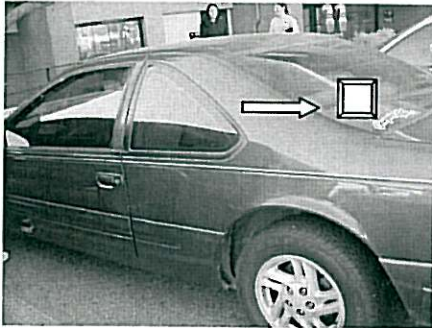
Example 1 – for most vehicles Do NOT place permit on bumper or on the side of the vehicle